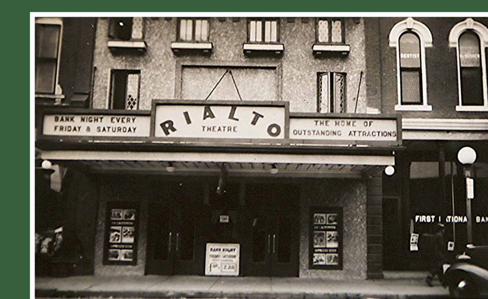
Rialto Theater in the 1950s